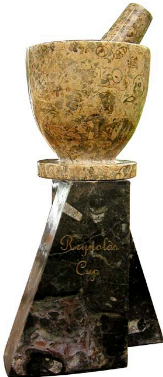
Figure 2. The Reynolds Cup trophy, awarded once every two years to the winner of an international quantitative mineral analysis competition (see http://www.dttg.ethz.ch/reynoldscup2004.html ).